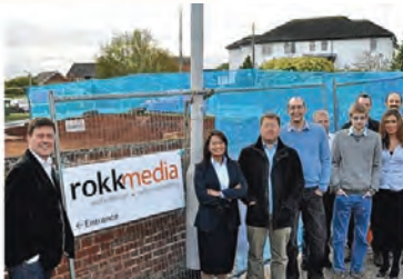
Some of the Rokk Media team standing proudly beside the new office development in Exeter.

Rokk Media provide a total digital solution from business process automation to web development and marketing.